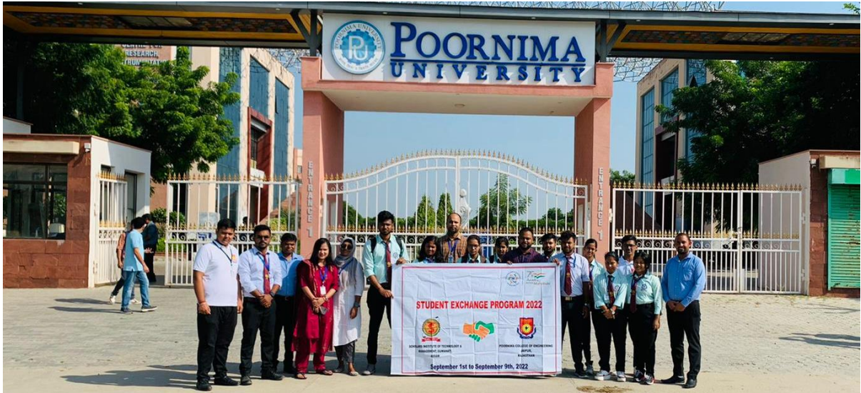
Figure: The group arrive at Poornima University.