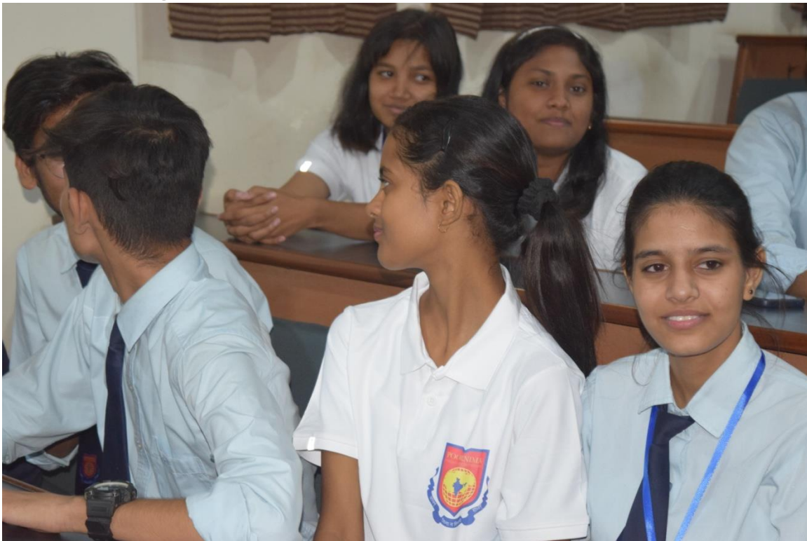
Figure: Glimpse of one mice event.

To strengthen the interaction between the students of SITM and PCE, an open mic event was conducted. The students from the both the colleges have shown their talents through poem recitation, storytelling, comedy, singing etc.