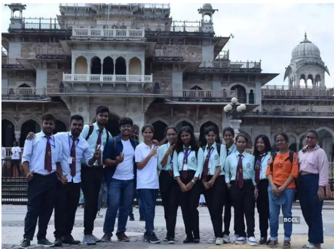
Inter College Student Exchange Program