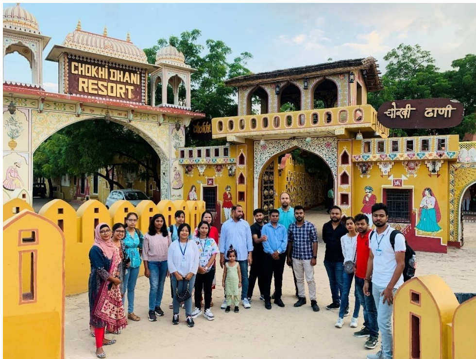
Figure: The group at the gates of Chokhi Dhaani.

Day 4 ends with the vivid colour of Chokhi Dhaani, where a glimpse of Rajasthan's culture, food, traditions and heritage is showcased. To attract and introduce tourists by