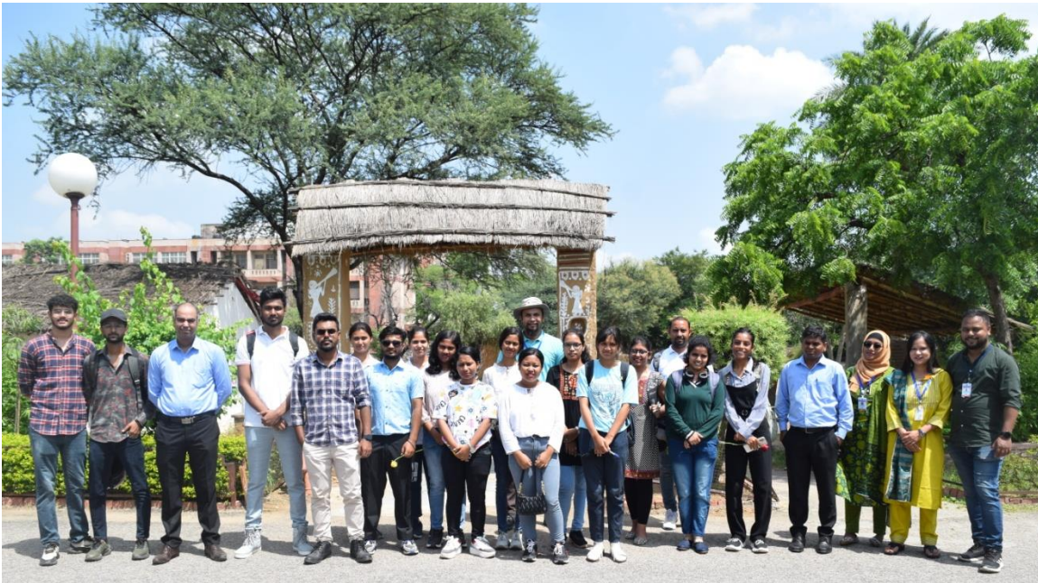
Figure: The entire group poses in front of Model villages for each part of Rajasthan.