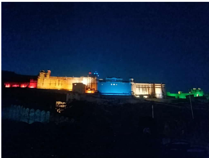
Figure: Amber fort light and sound show.

The day 3 of the student exchange program was ended with the light and sound show in Amber palace. The show is the amazing amalgamation various stories, legends of the Rajput Kings by harmonious folk music, lights with deep, baritone narration by Amitabh Bachchan.