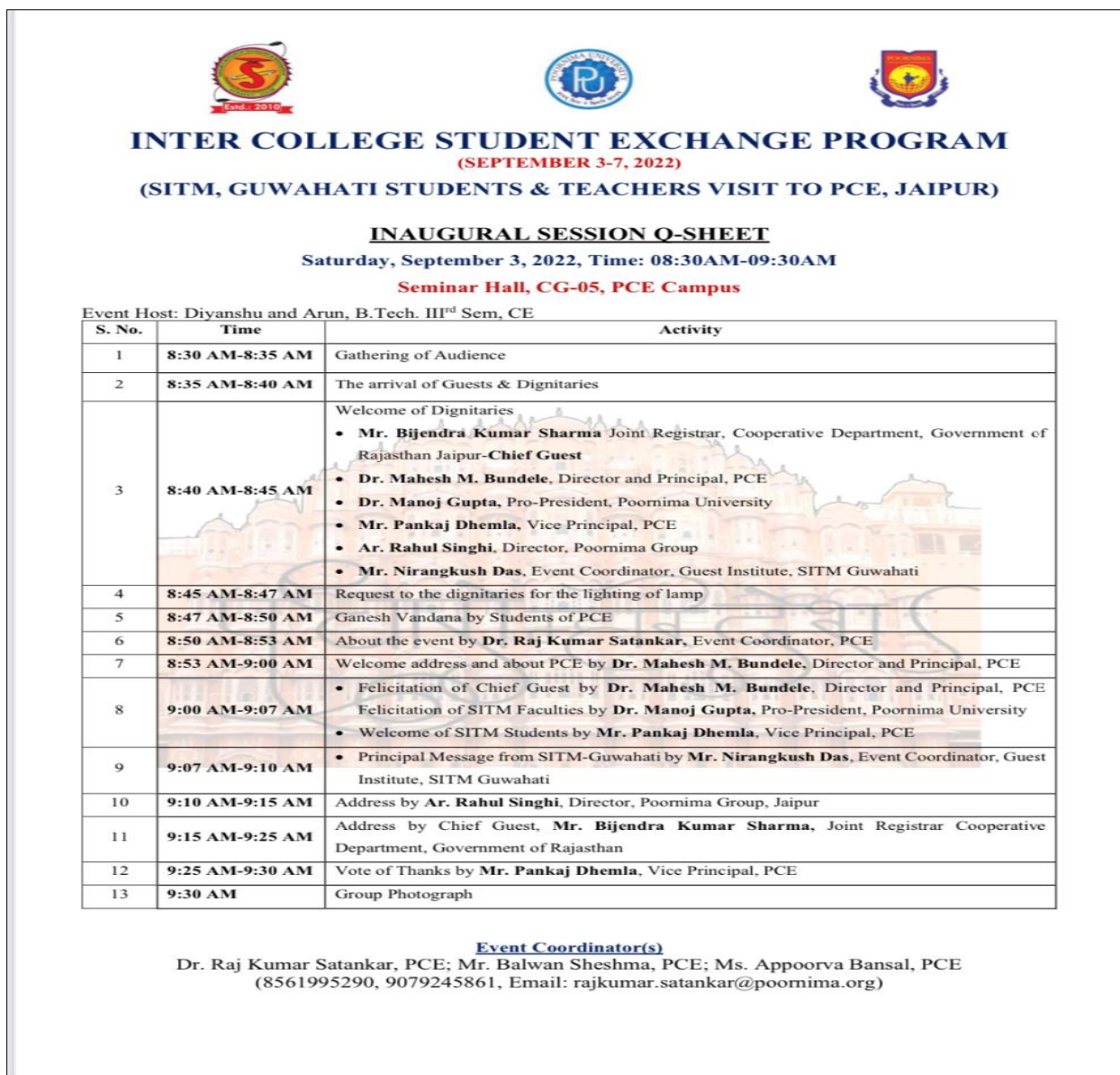
Figure: Welcome session Q-sheet