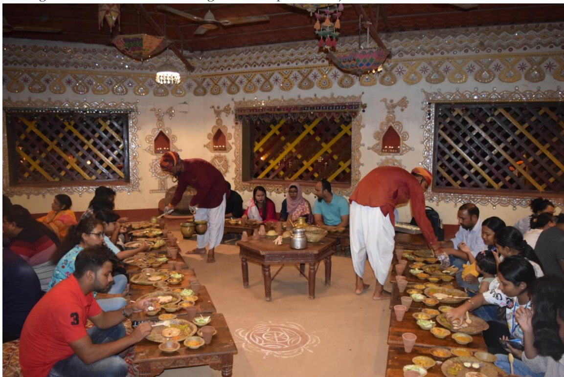
Figure: Various Rajasthani cuisine under one roof