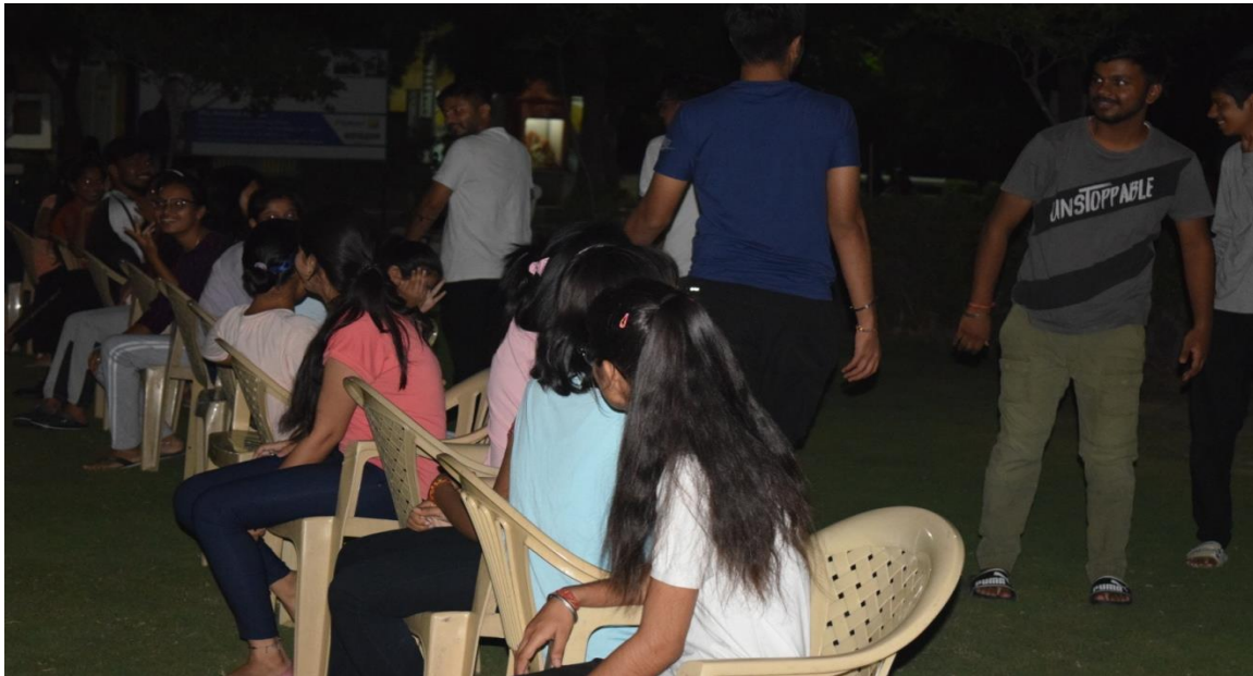
Figure: Students of SITM and PCE are enjoying the Musical Chair game.