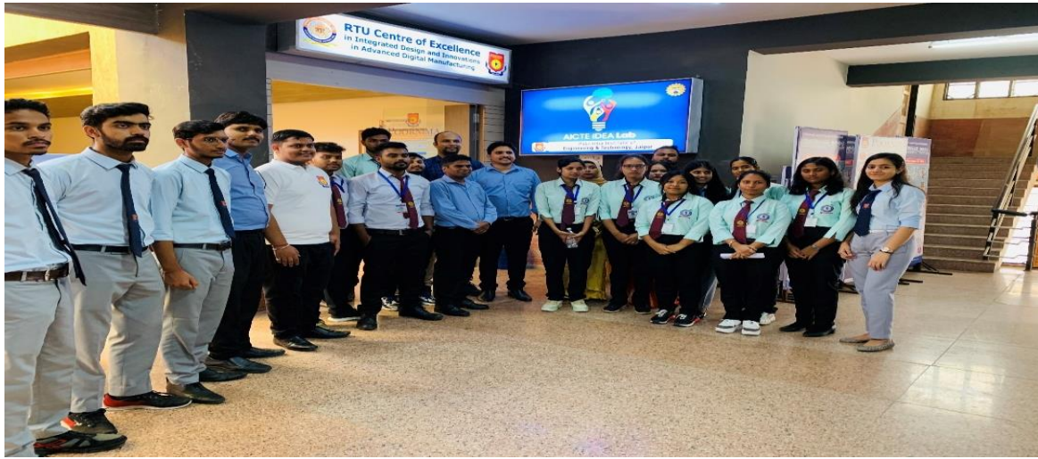
Figure: SITM students, faculties along with PCU students and faculties pose for a photograph at IDEA AICTE Lab.