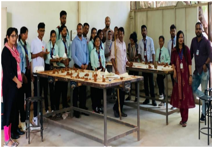
Figure: Attending a traditional Pottery making workshop at Poornima University.