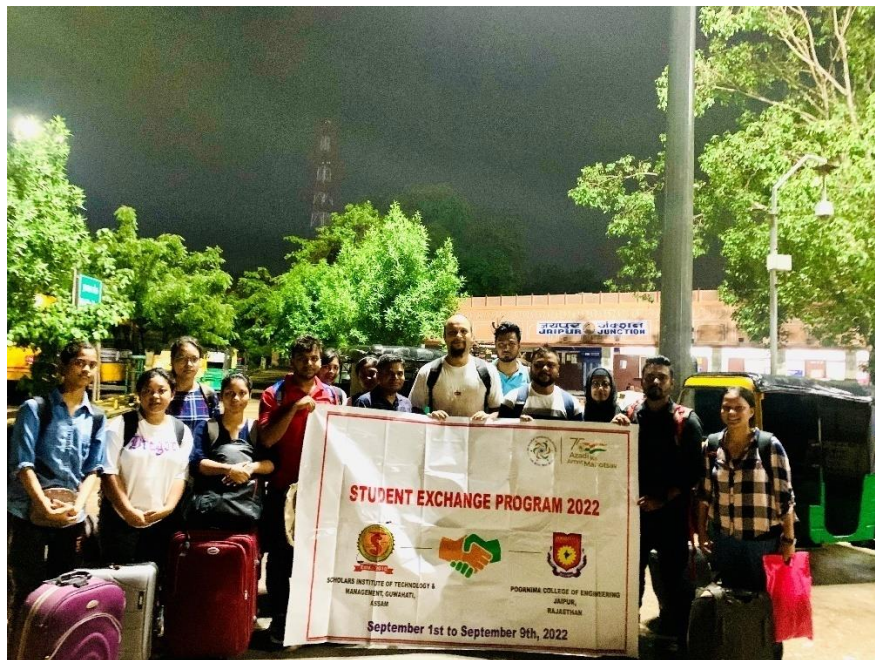
Figure: Students reached at Jaipur Junction (arrival time and date).