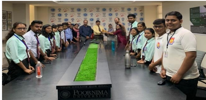
Figure: Meeting Vice Chancellor of Poornima University