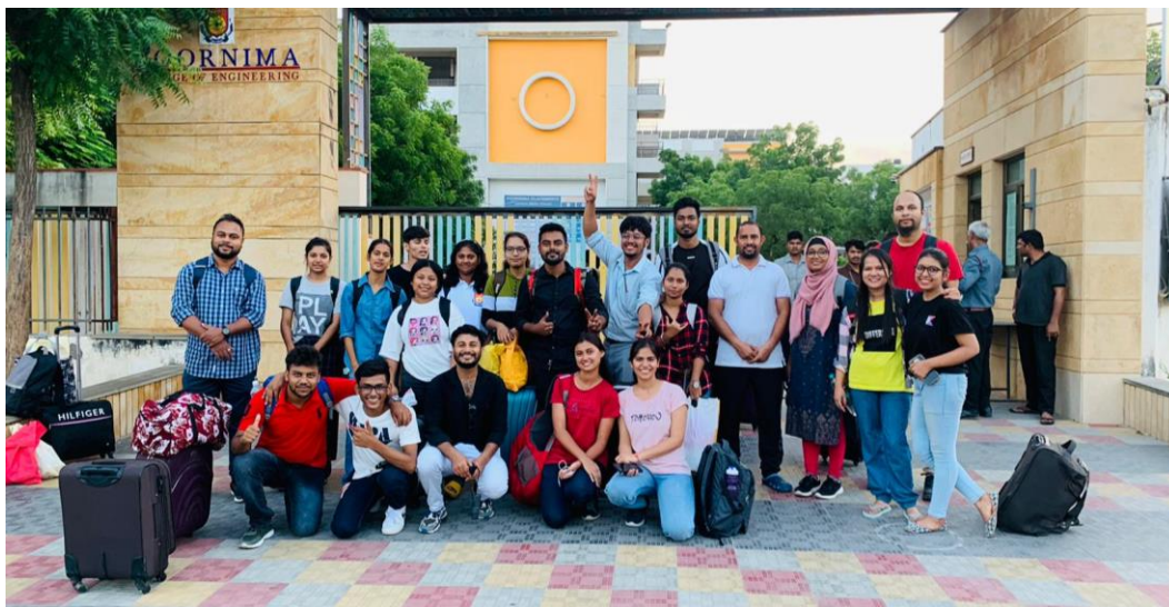
Figure: The group pose for one last picture at PCU prior to their departure.