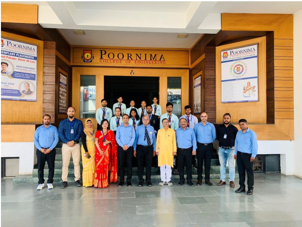
Figure: SITM students and faculties with PCE faculties and Director.