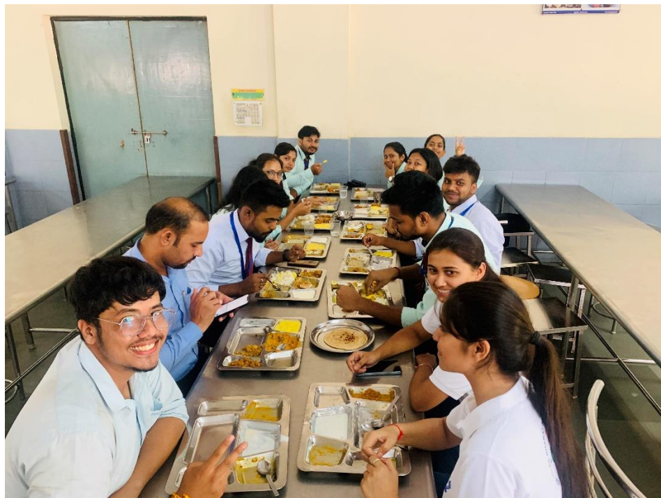
Figure: SITM students with their PCE counterparts.