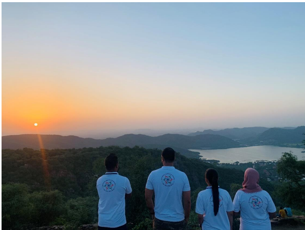
Figure: Top of Jaipur