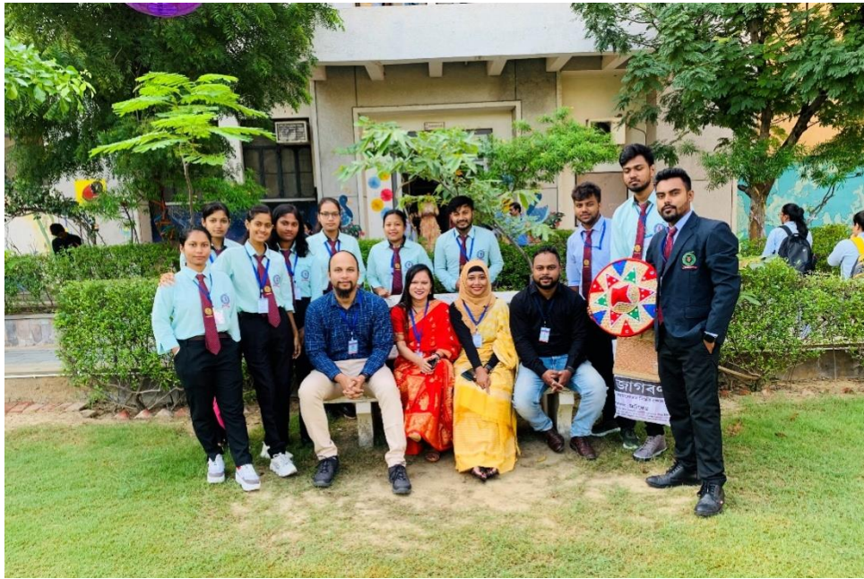
Figure: SITM students and faculties are ready for Day 1