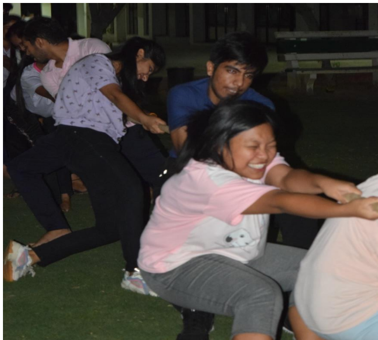
Figure : Students of SITM and PCE are enjoying the tug of war game.