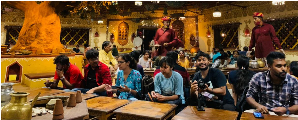
Figure: SITM students waiting for a sumptuous Rajasthani thali at Chokhi Dhaani.

depicting Haldighati battles, Rath Khana, and the Temples of Chokhi Dhani. The place also has various activities for visitors, such as animal and cart rides, music and dance performances by locals (kalbeliya, ghoomar, chari dance), and games (Bhool bhulaiya, Jungle Sair, Gufa Jharni).