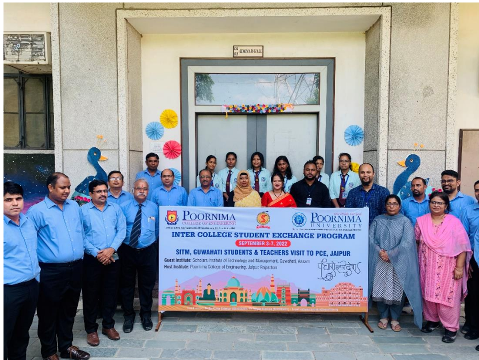
Figure: SITM students and faculty visiting PIET campus