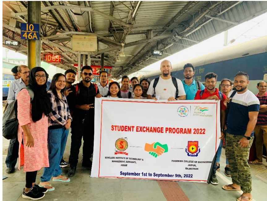
Figure: Students leaving from Guwahati Railway Station (Departure Time and date)