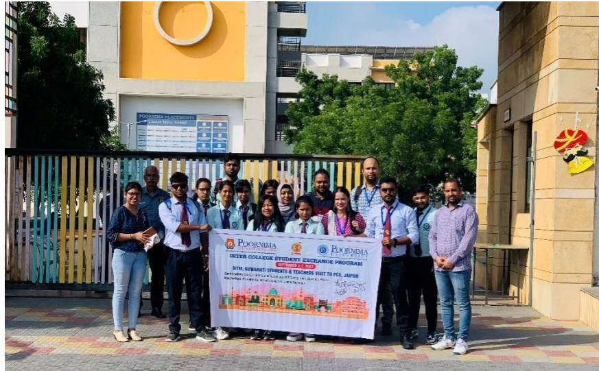
Figure: The group ready for a whole day tour of the Pink City.