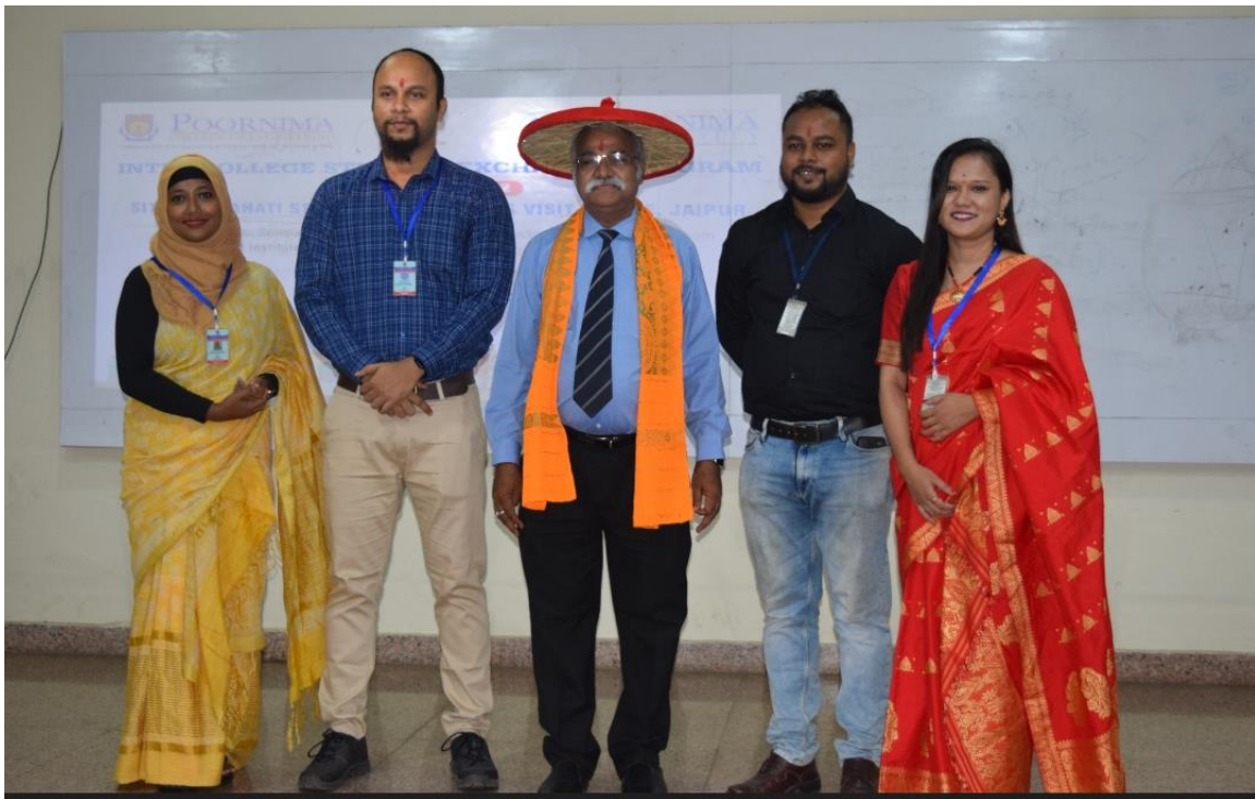
Figure: PCU Director honored with traditional Assamese Arnai and Japi