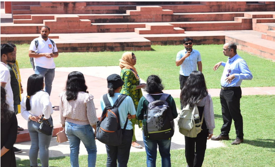
Figure: A description of nine squares plan of Jawahar Kala Kendra by Ar. Saurabh Sharma.