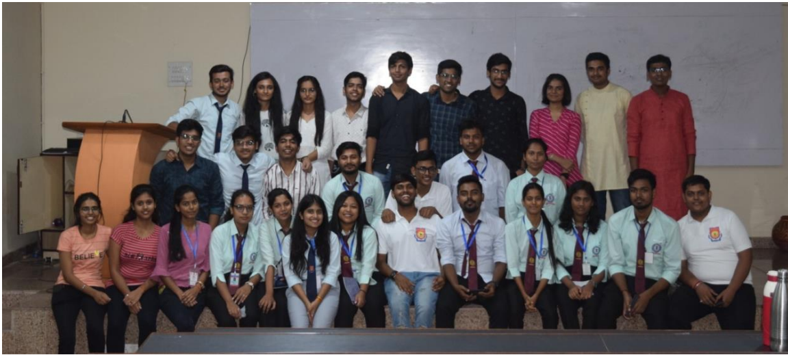
Figure: Students of SITM and PCE pose for One mic event.