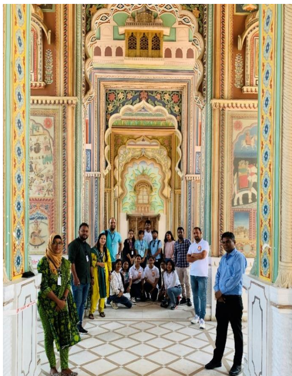
Figure: The group poses inside Patrika Gate

Day 4 of the inter-college student exchange program starts with one of the architectural and cultural heritage symbols, Patrika Gate, Jaipur. Interestingly, the pillar of the gate depicts various regions of Rajasthan.