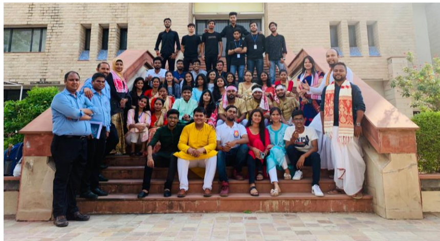
Figure: A picture with PCU students and coordinators.