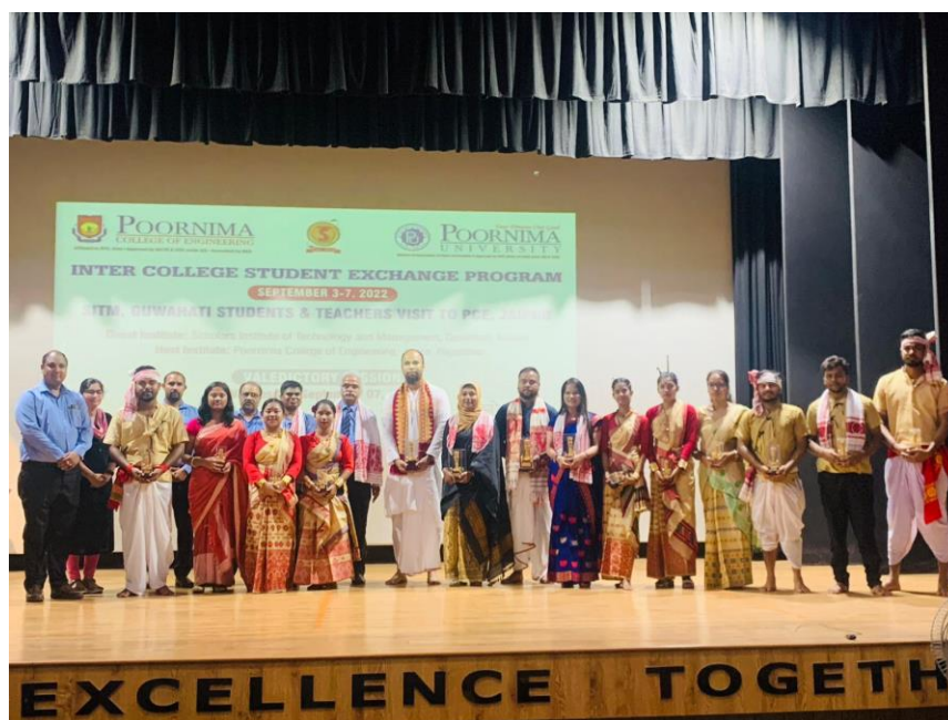
Figure: SITM students and faculties being feted at the end of the session.