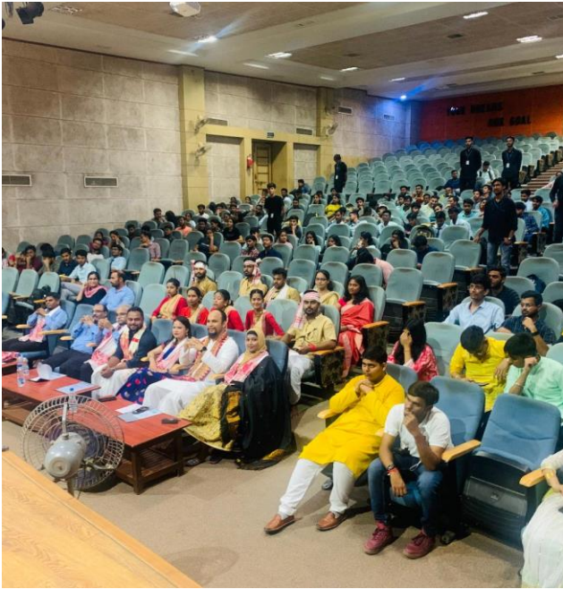
Figure: The dignitaries attending the valedictory session.