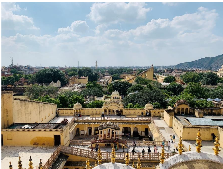
Figure: Interior of Hawa Mahal as seen from its tallest structure.

After tasting the local street food of Rajasthan, the group visit the Hawa Mahal. This five-floor structure with intricate latticework was built by Maharaja Sawai Pratap Singh and designed by Lal Chand Ustad in 1799. Interestingly, the street view of the Hawa Mahal is from the back of the palace.