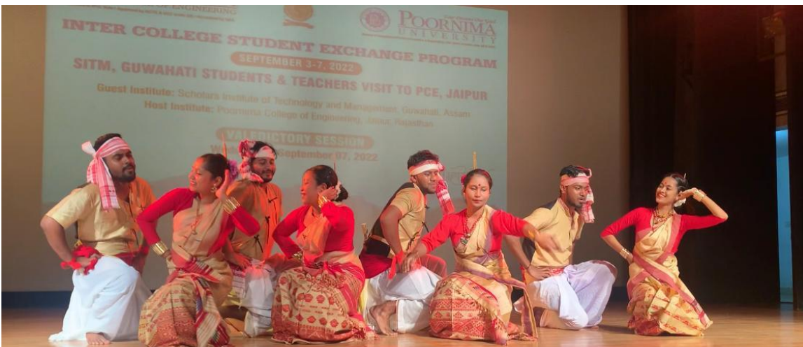
Figure: SITM students performing Assam's traditional Bihu dance.