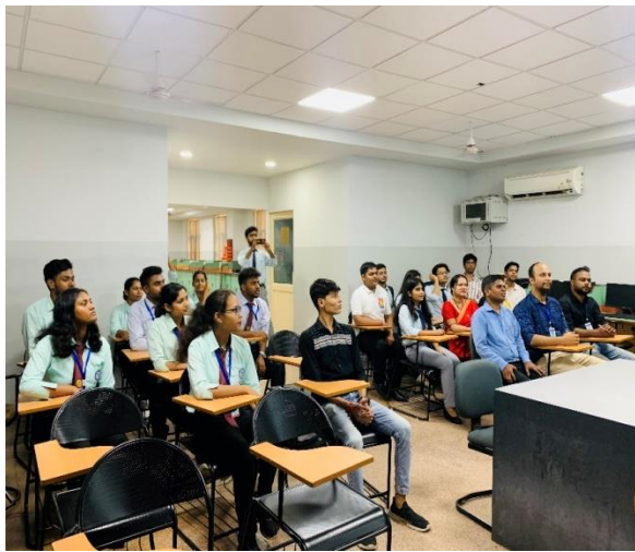
Figure: AICTE IDEA lab demonstration

Poornima Institute of Engineering and Technology (PIET) is one of the important colleges of the Poornima Group. PIET is the only one institute in Rajasthan to establish AICTE-Sponsored IDEA Lab for training and development of students and society with hand on learning of latest technologies. The total cost of the project is split into AICTE (50.39 Lakh), Industry and Institution (58.27 Lakh) along with some additional expenses (6.12 Lakh).