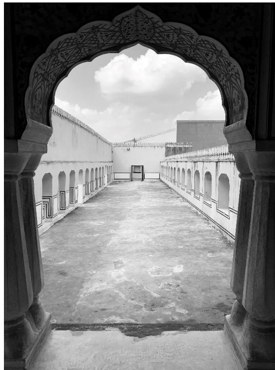
Figure: The exquisite architectural design inside Hawa Mahal