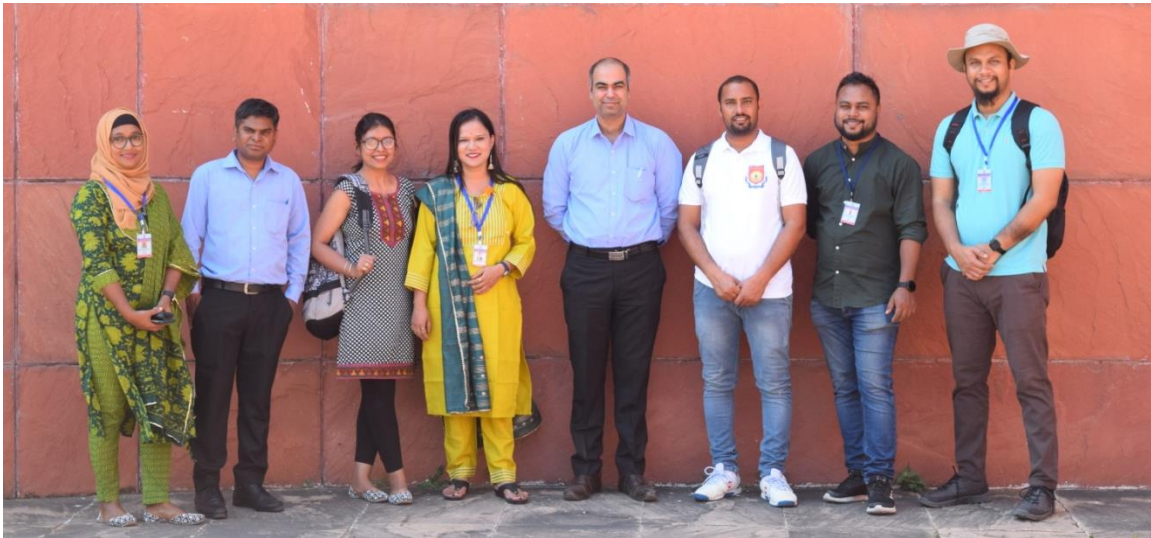
Figure: Faculties of SITM and PCE pose in the Jawahar Kala Kendra.