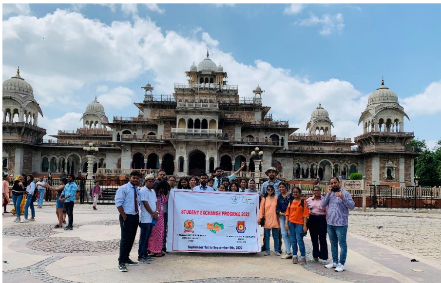
Figure: The group pose in front of the 18 th century Albert Hall.

Day 2 of the Inter-college student exchange program starts with Jaipur city's oldest museum, the Albert Hall Museum (also known as the Government Central Museum). This Indo-Saracenic museum is named after King Edward VII (Albert Edward) which has a rich collection of paintings, jewellery, carpets, ivory, stone, sculptures, crystals and coins from various periods (Gupta, Kushan, Delhi Sultanate, Mughal, British).