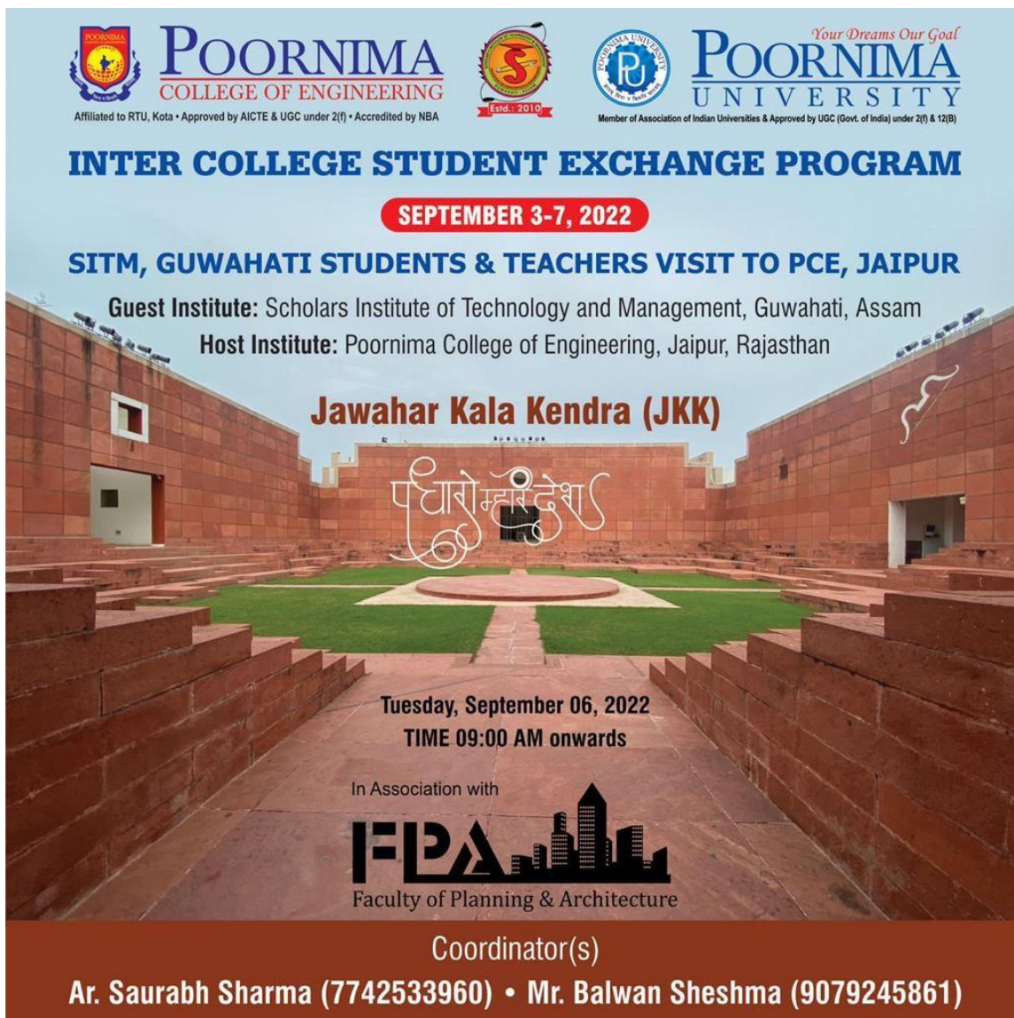
Figure: Poster for visit to Jawahar Kala Kendra.