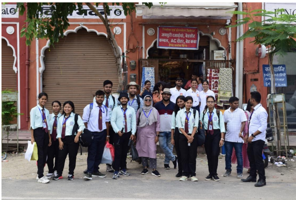
Figure: The group the busy market of Bapu Bazar.