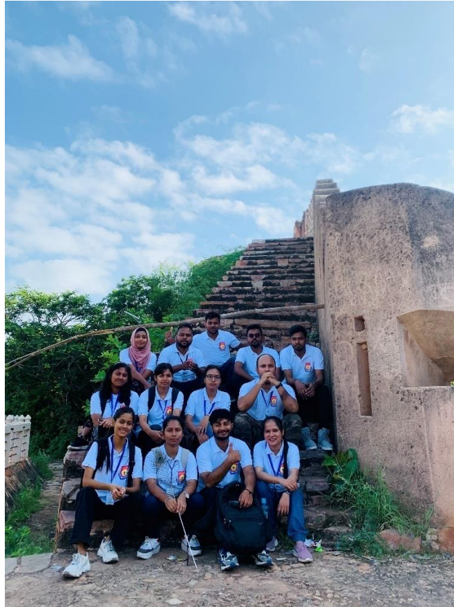
Figure: The group pose near Rang De Basanti point at Nahargarh fort

Day 3 starts with the heritage walk to the peaceful Nahargarh fort with the fantastic sunrise and the whole Jaipur city view. Throughout the heritage walk, the coordinators of PCE have explained the history, traditions and also the popular film shooting spot (Rang De Basanti spot) of the Nahargarh fort.